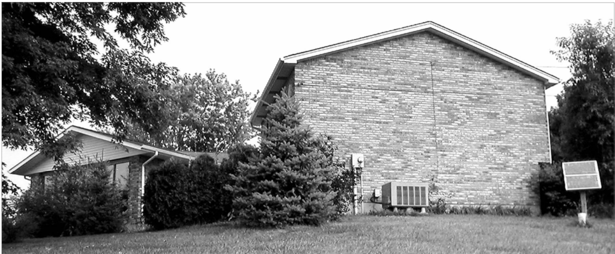
Figure 2.3: The Robbins home and office with PV module.

SW Ohio Alternate Energy Association (AEA) Email: aea@aea1.org Web site: www.aea1.org Cincinnati area networking and info